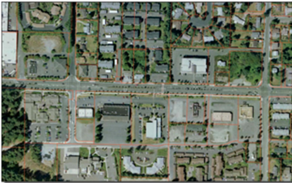
Bridgeport Way transformation opportunities: University Place, WA

The City of University Place identified empty, redevelopable space along the corridor and at intersections. The photo below shows ample space that has been used for parking, building setbacks, and other uses.