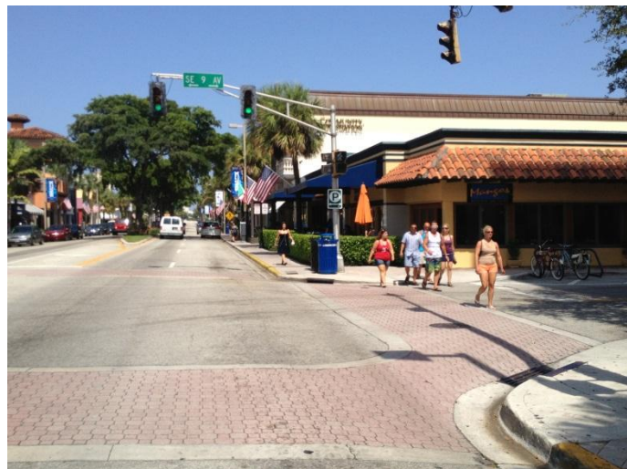
Crossings should be designated on every leg of all intersections in an urban context