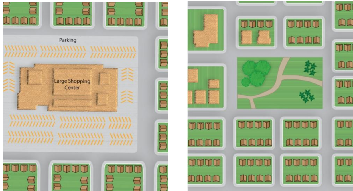
Conversion of shopping center to a neighborhood

Infill development between nodes that follows the principles of this document will help to connect the nodes into livable neighborhoods.