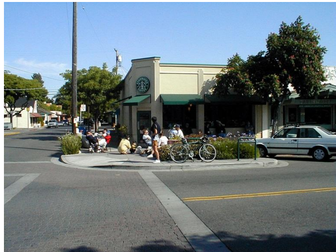
Curb extensions with tight corner radii and outdoor seating

All of these changes can free up space, which can be used for additional elements. To improve street quality, local jurisdictions can incorporate the following elements or others included in other chapters of the Broward Complete Streets Guidelines .