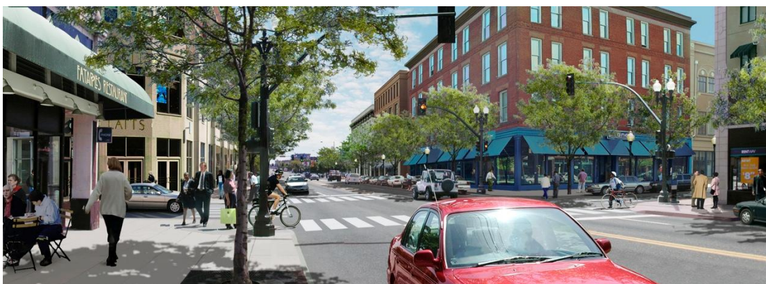
Example of a transformed suburban street