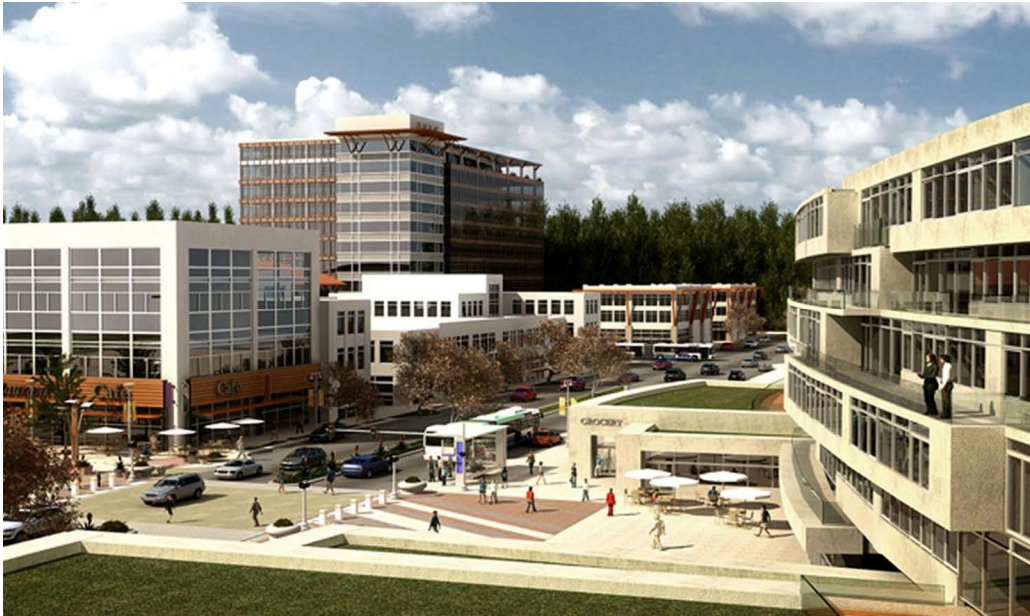
Bridgeport Way plan: University Place, WA (Credit: City of University Place)

The City planned for new development that would create a new place , as shown in the rendering below.