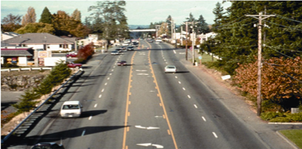
Bridgeport Way before transformation: University Place, WA

Before reconstruction, Bridgeport Way in University Place, Washington, was a classic auto-oriented suburban arterial street. The existing street had a high accident rate, and did not support economic growth; it attracted neither people nor investment.