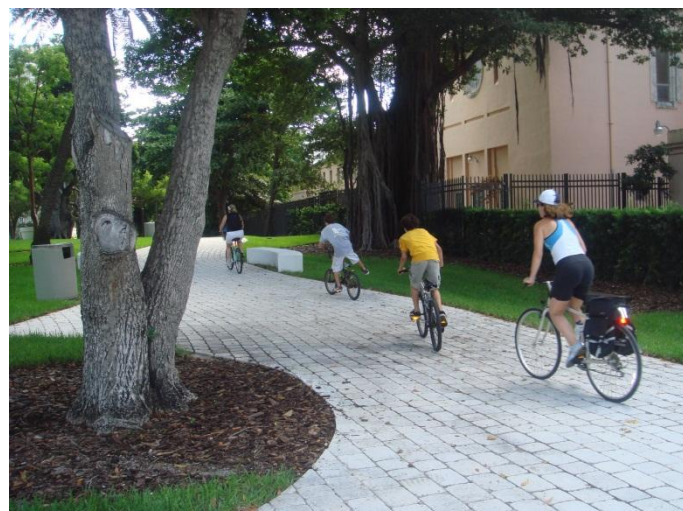
Bicyclists on a connector path between two street rights-of-way