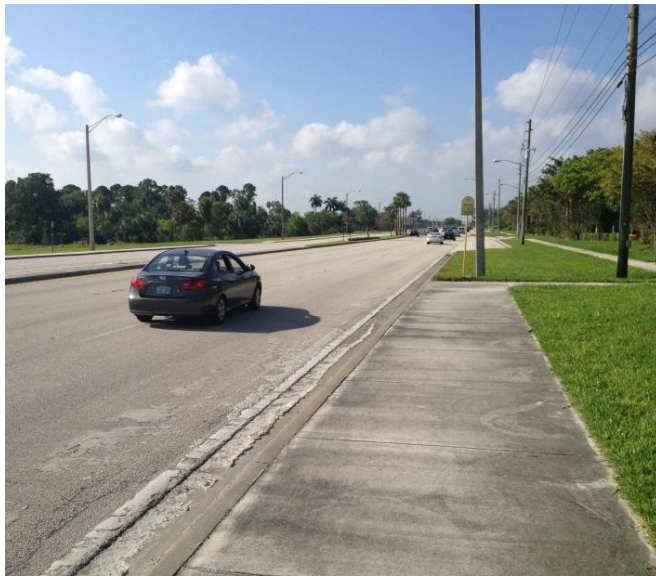
Sidewalk on a suburban boulevard in Broward County near a bus stop

Changing demographics also present challenges. Suburban homes have been built to accommodate young families with children, but fewer households now fit that profile. More and more households are comprised of empty nesters, young singles, divorced adults, and other non-nuclear families, and this trend is expected to grow in the future. Therefore, environments that foster social capital are more important than ever.