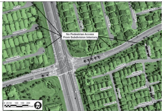
Cul-de-sacs break up connections. (Credit: PB Americas, EWA Connection Study , May 2009)

sacs, put the connectors in, and then sold the homes. In cases where a local government is still developing suburbs, it should make connectivity a fundamental priority by following the principles in Chapter 4, "Street Networks and Classifications."