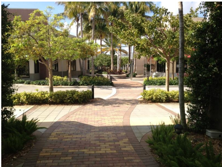
Pedestrian connector path between buildings, Coconut Creek Promenade