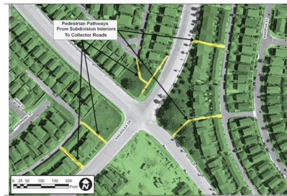
Pedestrian networks can be re-established by opening noise walls and connecting new sidewalks.