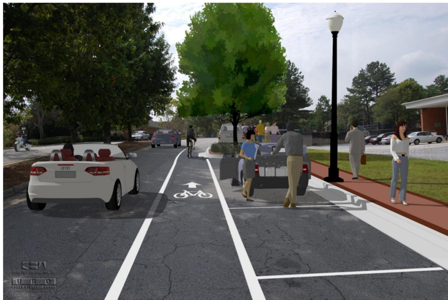
Simulation of the positive result of a 4-lane to 2-lane road diet with bike lanes and on-street parking