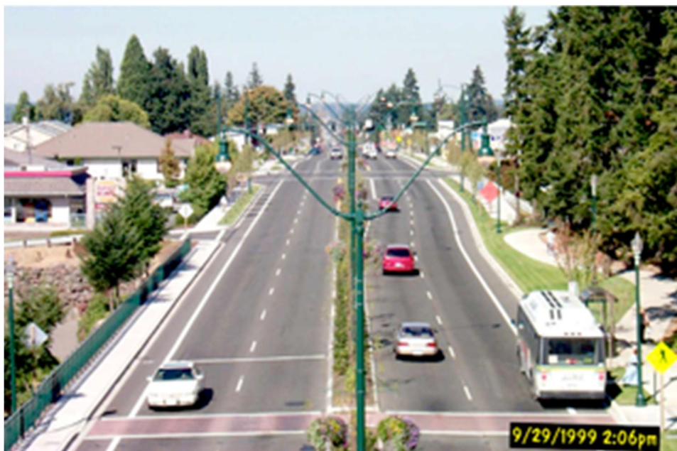
Bridgeport Way after transformation: University Place, WA

After reconstruction, the corridor served more people, was far safer, and drew economic development.