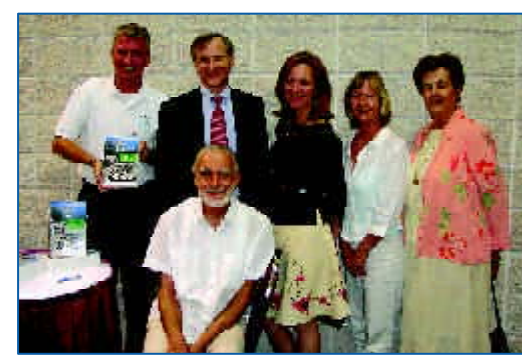
Each of the speakers from the Scenic Highway Celebration provided details on how the scenic highway designation should move forward.

On April 24, 2006, staff from the Broward County MPO organized a special reception at the Broward County Convention Center to celebrate the completion and approval of the Eligibility Phase requirements for Scenic Highway designation for State Road A1A. The scenic 32-mile A1A corridor runs from the Broward County/Palm Beach County line to the Broward/Miami-Dade County line and serves as a functional multi-modal transportation corridor for the county.