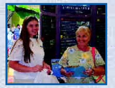
MPO staff members provided details of the transportation planning process to the public.