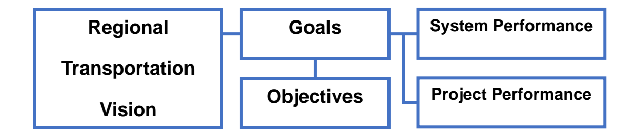
Figure 1: Hierarchy of Performance Measurement

It is important to note that some transportation objectives are more statements of policy direction and can be very challenging to measure, quantify, and in most cases replicate. As illustrated in Figure 1, performance measures ensure that decisions align with and are promoting established transportation goals.