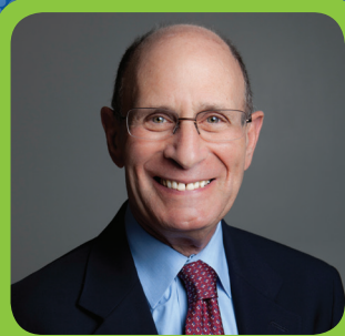
COMMISSIONER RICHARD BLATTNER CHAIR, BROWARD MPO CITY OF HOLLYWOOD, DISTRICT 4