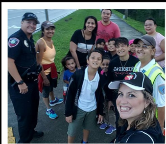
Panther Run Elementary