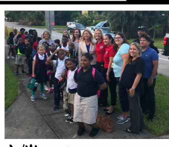
Wilton Manors Elementary

Hundreds of students, parents & staff participated countywide