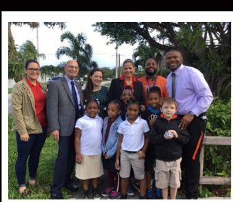
Orange Brook Elementary