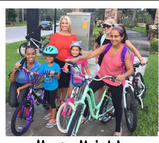
Heron Heights Elementary