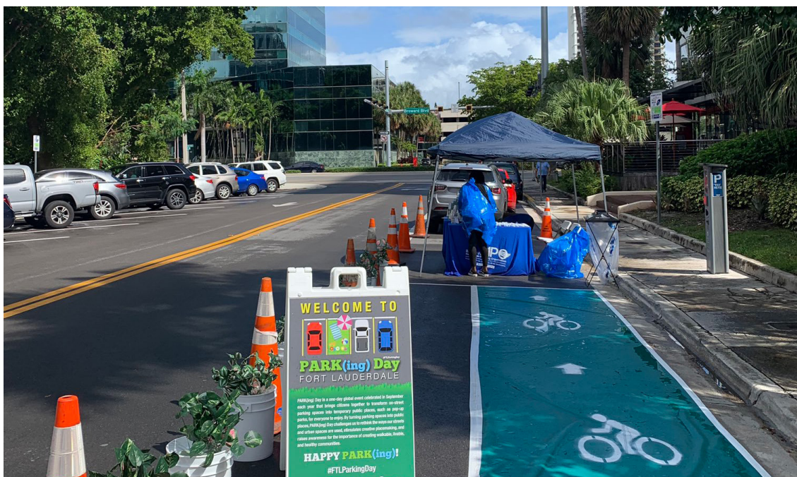
The MPO participated in the annual PARKing Day event held in Downtown Fort Lauderdale and had the opportunity to speak with residents about the benefits of Complete Streets.